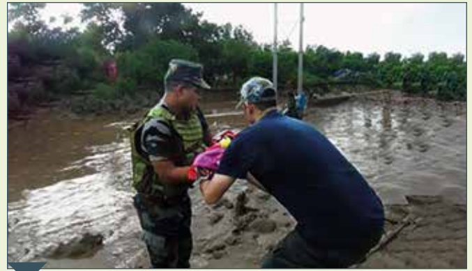
The Indian Army deployed 13 flood relief and rescue columns in HADR operations in response to the massive floods in Jammu and Pathankot. 24 civilians including children were safely evacuated from flood-affected areas in Balle Da Bagh near Akhnour.