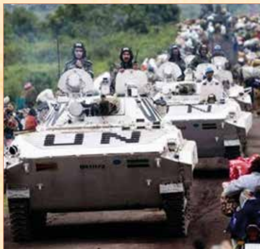
MONUSCO ( CONGO)