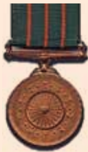
KC - 02