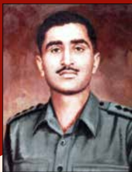
CAPTAIN GURBACHAN SINGH SALARIA GORKHA RIFLES