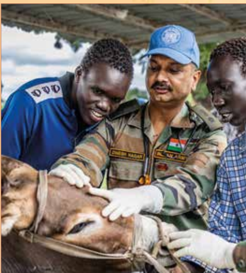
UNMISS (SOUTH SUDAN)