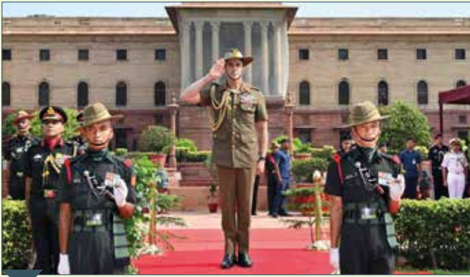
Lieutenant General Simon Stuart, Chief of Army, Australian Army on official visit to India from 11 -14 Aug 2025, reviewed the Guard of Honour at the South Block.