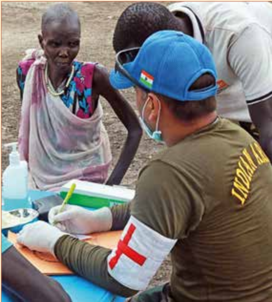
UNMISS (SOUTH SUDAN)