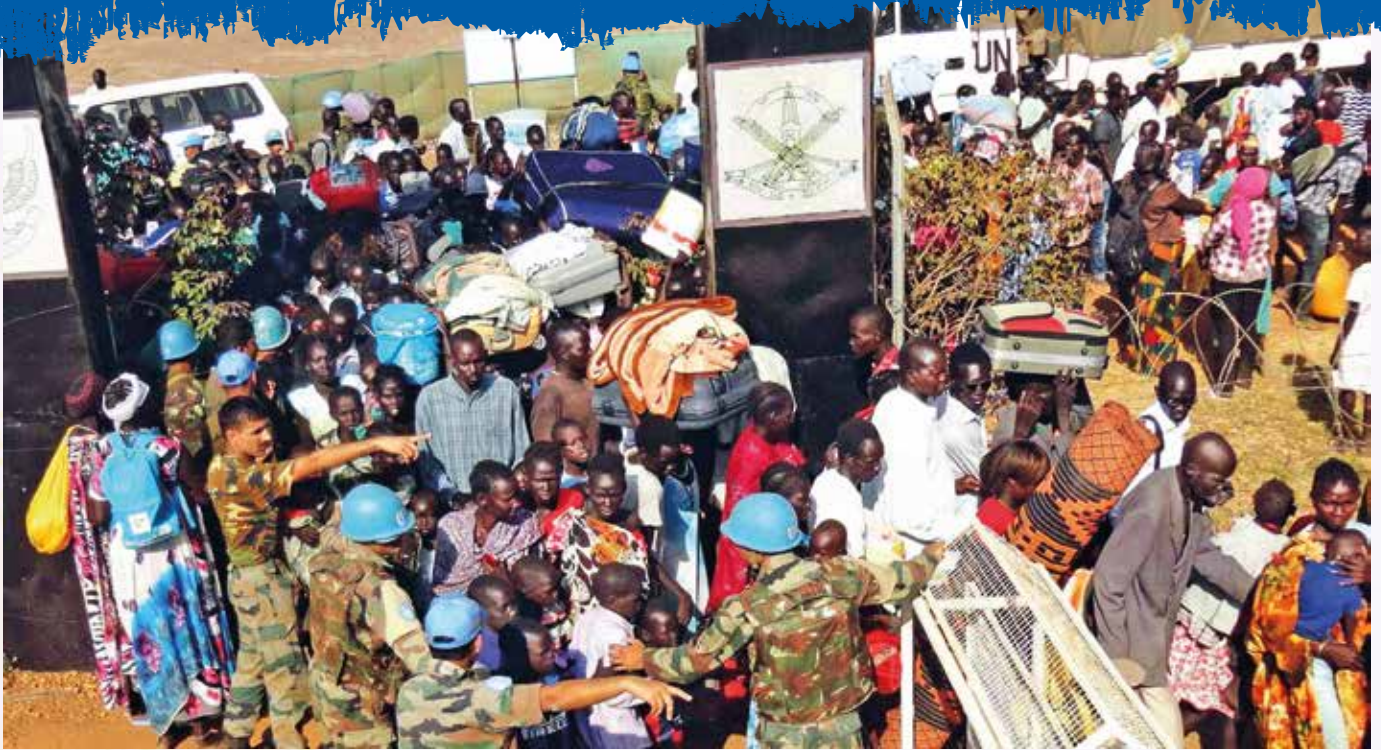
PROTECTING CIVILIANS IN SOUTH SUDAN (UNMISS)