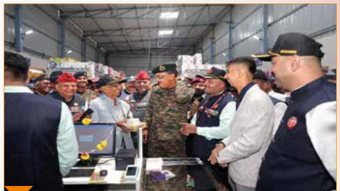
General Officer Commanding, Dakshin Maharashtra & Goa Sub Area inaugurated a new Canteen building at Karad for Ex-Servicemen & Veterans.