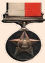
MVC - 05