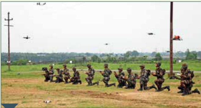
Brahmastra Corps under the aegis of Eastern Command conducted Ex POORVI DRONE KAUSHAL at Ranchi Military Station, showcasing integration of indigenous drone tech in combat ops which included 36 teams executing a coordinated operation under simulated battlefield conditions.