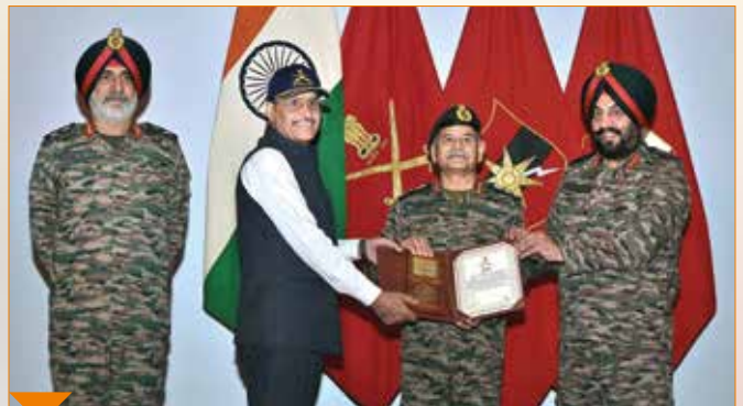
General Upendra Dwivedi, COAS, honoured four Veterans with the 'Veteran Achievers Award' at Bathinda Military Station on 13 August 2025 for their exceptional contributions.