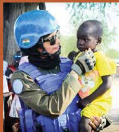
UNISFA ( ABYEI)

Protect women and children, reduce gender-based violence and establish trust within vulnerable communities.