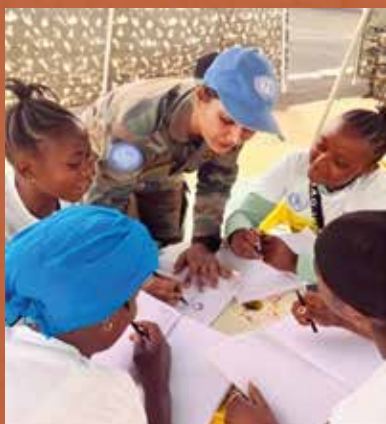
MONUSCO ( CONGO)