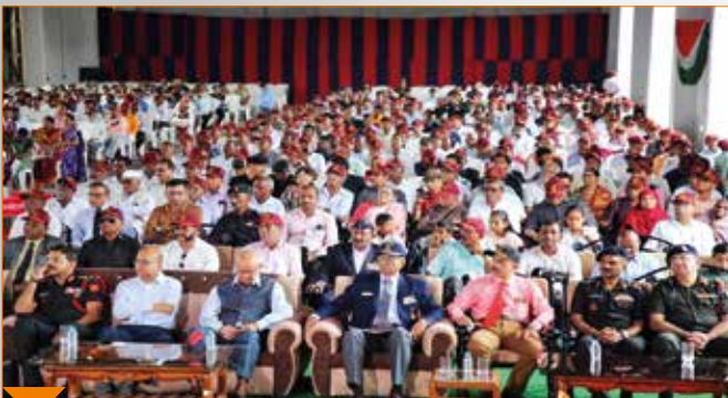
Sure Swift Striker Brigade organised a Mega Ex-Servicemen Rally at Chhatrapati Sambhajnagar Military Station, uniting over 2500 Veterans including 78 Veer Matas, Veer Naris, senior veterans and decorated achievers from across Marathwada.