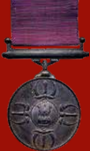
PARAM VIR CHAKRA