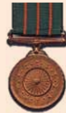
SC - 09