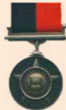
VrC - 21