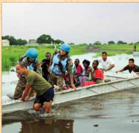
UNMISS (SOUTH SUDAN)

Indian peacekeepers provide crucial humanitarian aid through disaster relief and assistance in rebuilding homes and community infrastructure.