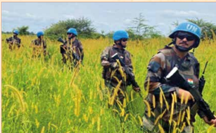
UNISFA ( ABYEI)

It includes establishing safe zones, patrolling demarcation lines and responding decisively when civilians are under threat - often intervening amidst hostilities.